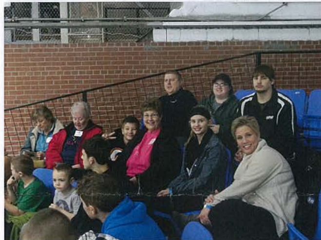
Some of the Chapter members who enjoyed the Lincoln Stars hockey game.